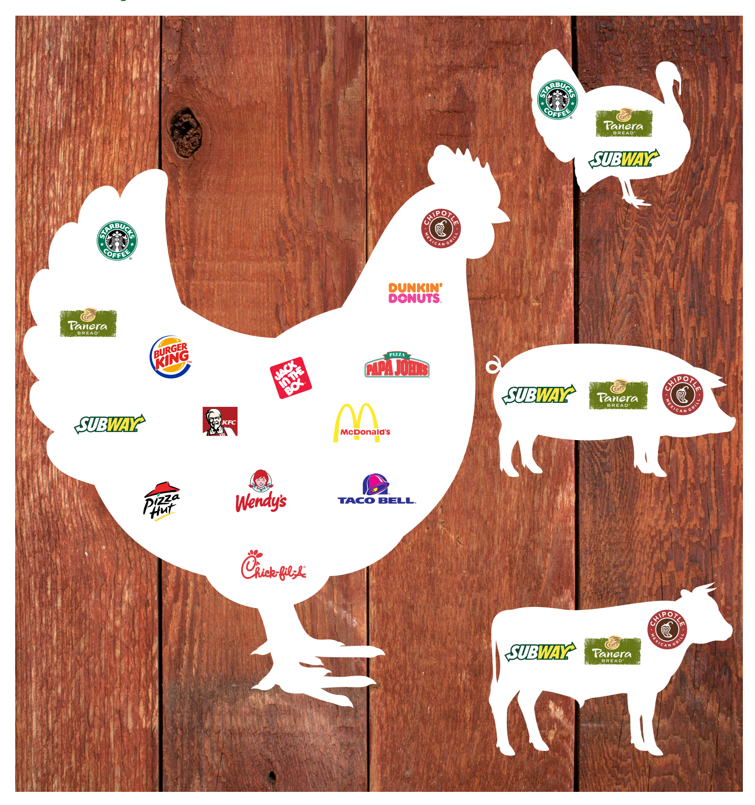
Fourteen of the top 25 restaurant chains have taken action to end routine use of medically important antibiotics in at least some of their chicken supply. But there has been much less progress in turkey, pork and beef.